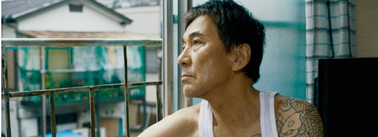
Kōji Yakusho in Under the Open Sky

20:30 – 23:30 Guest Country Evening Japan —> Tickets Location: Filmforum Cinema, Bischofsgartenstr. 1