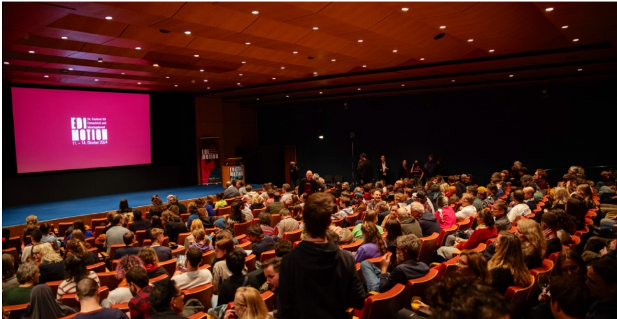
Almost ready to start – our opening night in 2024

Founded in 2001, Edimotion is the oldest and largest festival in the world that focuses exclusively on film editing. Known as „Filmplus“ until 2019, the four-day festival based in Cologne includes cinema editing awards in three categories as well as a lifetime achievement award, plus screenings, film talks, panel discussions, workshops – all aimed at enhancing appreciation for the art of film editing.