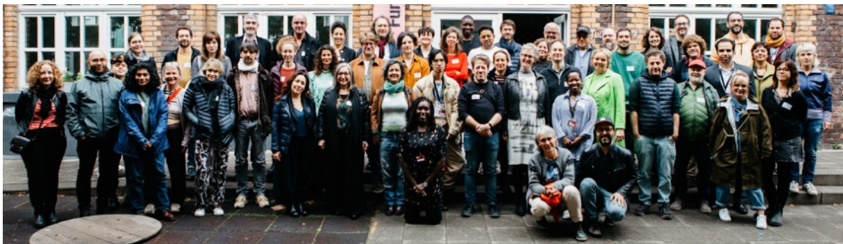
50 editors from 26 countries took part in the IFEF 2022 → will we break that record this year?

Now in its 8th year, the IFEF is an intense networking event, that has in previous years attracted editors from over 30 countries.